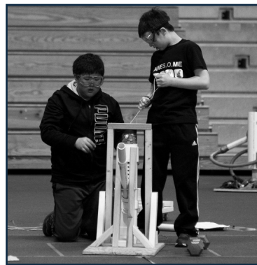
D39 students compete at Science Olympiad state competition last spring.

For more information and to purchase tickets to Foundation events, visit www.d39foundation.org .