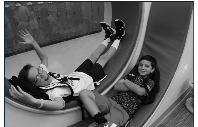
These two get the best seats in the house at the new Harper School Learning Commons